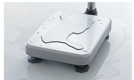
IP65 base unit with a SUS430 pan

The base unit can be washed with water, not to mention that wet objects can be weighed with no problem. Further, the surface of the pan is resistant to chemicals, scratches and rust, and easy to keep clean and hygienic.