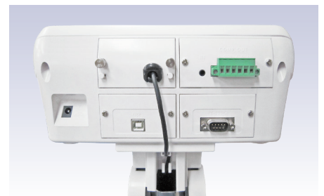
Display unit with HVW-02CB, HVW-03C, and HVW-04C

* 6 For communication with a PC only. The driver software can be downloaded for free.